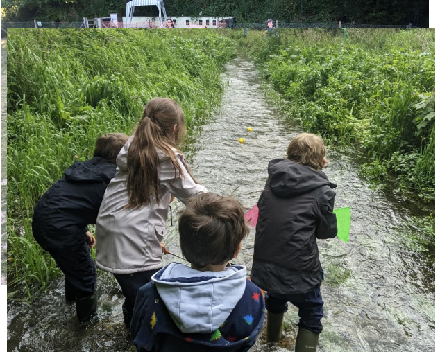
Beavers Section Leaders - Woodside & Kestrel Colonies