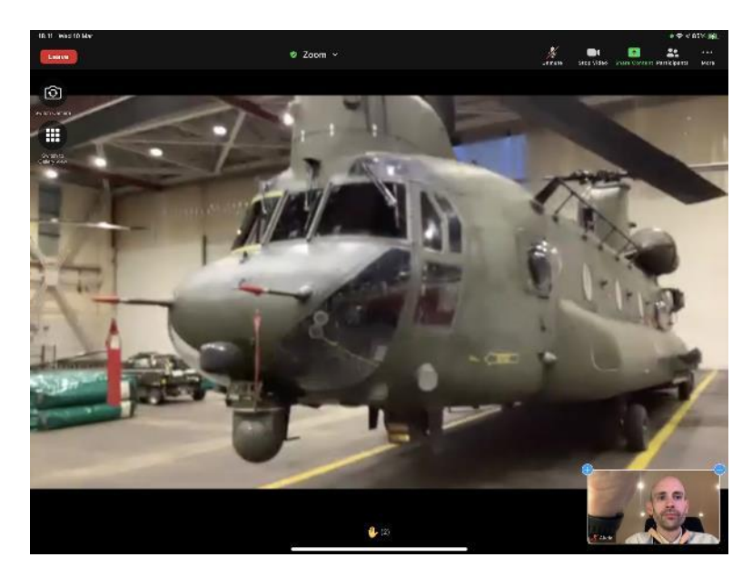
The rest of the term was rounded off with a fantastic virtual visit to RAF Odiham and an Emergency Aid session run by Hampshire Scouts.